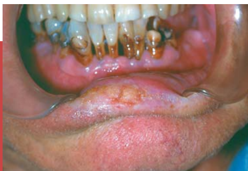
Figure 3: Acute necrotizing ulcerative gingivitis with recession of the gingivae and lip lesions

to be more prevalent among smokers than nonsmokers. 24 A study on individuals with HIV showed a relationship between smoking and this kind of gingivitis. 25