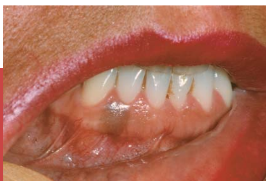
Figure 2: Smoker's melanosis

Smoking can cause pigmented lesions or exacerbate existing pigmentations in the oral mucosa ( Figure 2 ). Chemicals in tobacco smoke cause over-production of melanin, especially on the anterior labial gingiva. This type of melanosis occurs in 21.5% of patients who smoke. 18 The intensity of the pigment is linked to the quantity of tobacco used and the duration of use. 19 Smoker's melanosis is asymptomatic and reversible. Nonetheless, it may take several years after the person has stopped smoking for the lesions to disappear. 18,20